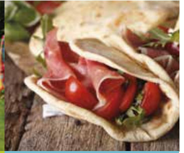
Restaurants and typical local products