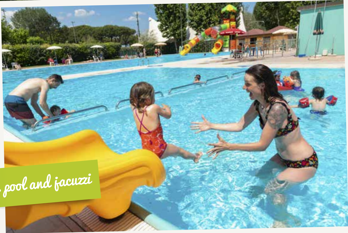
Swimming pool and jacuzzi