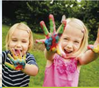
Activities and Mini Club